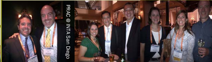
PRAC @ INTRA San Diego