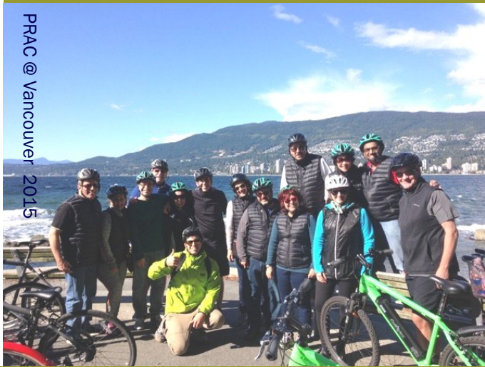
PRAC @ Vancouver 2015