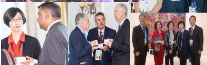
PRAC @ PDAC Toronto 2014