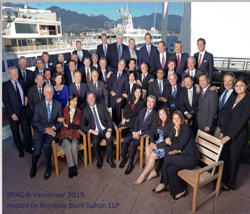
PRAC @ Vancouver 2015 Hosted by Richards Buell Sutton LLP