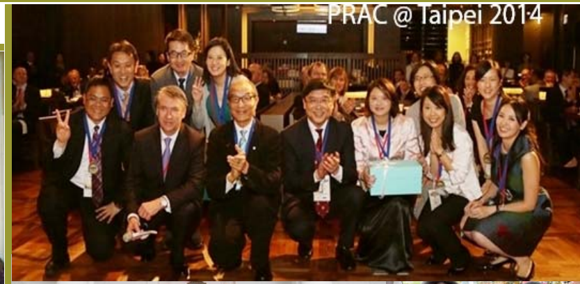
PRAC @ Taipei 2014