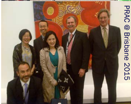
PRAC @ Brisbane 2015