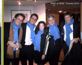
PRAC @ PDAC Toronto 2014