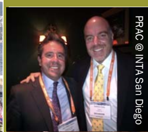
PRAC @ INTRA San Diego