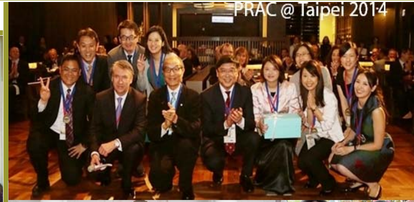
PRAC @ Taipei 2014