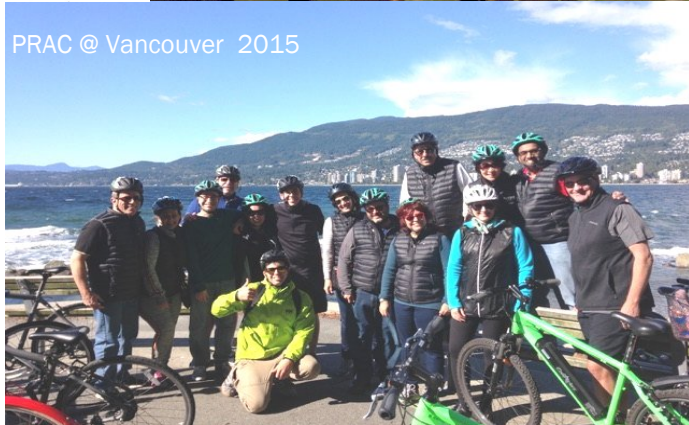
PRAC @ Vancouver 2015