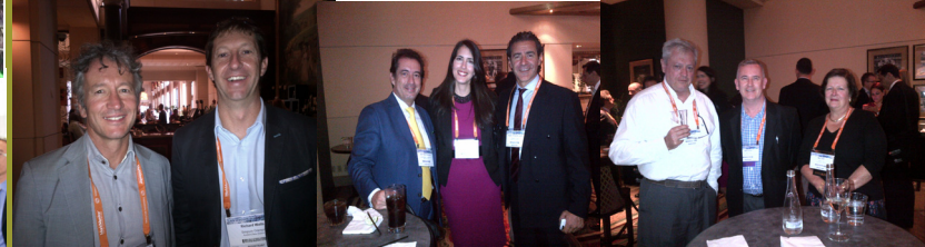
PRAC @ JPA Hong Kong