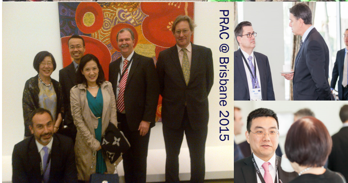
PRAC @ Brisbane 2015