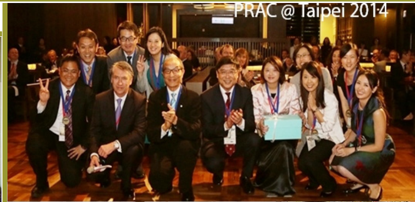
PRAC @ Taipei 2014