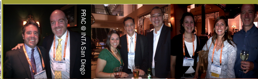
PRAC @ INTRA San Diego