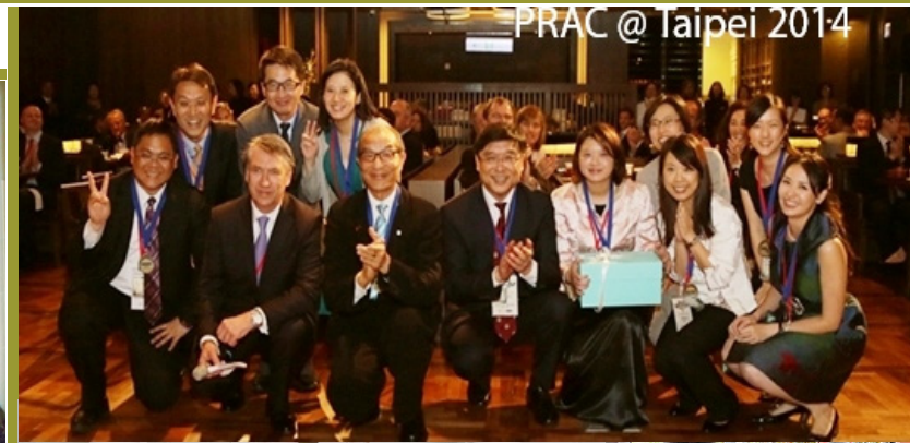
PRAC @ Taipei 2014