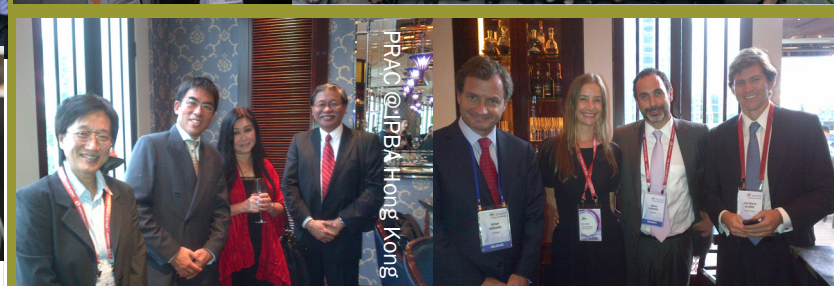
PRAC @ JPA Hong Kong