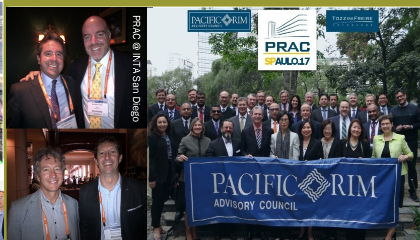
PRAC @ INTRA San Diego