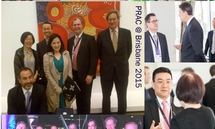
PRAC @ Brisbane 2015