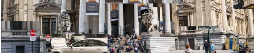
Netherlands | EU